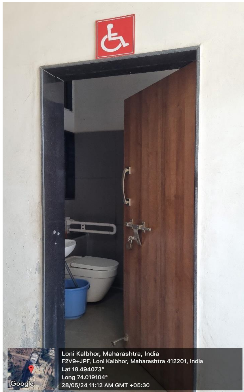
Divyangjan Friendly Washroom