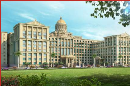
MIT- ADT - Administrative Building