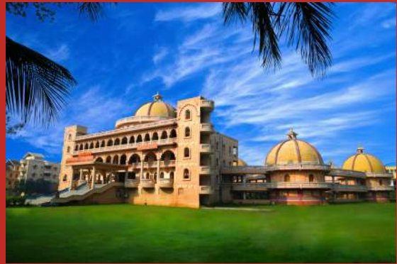
Sangeet Kala Academy