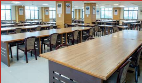
24 x 7 Reading Room