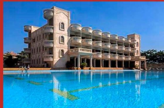
Gymkhana & Swimming Pool